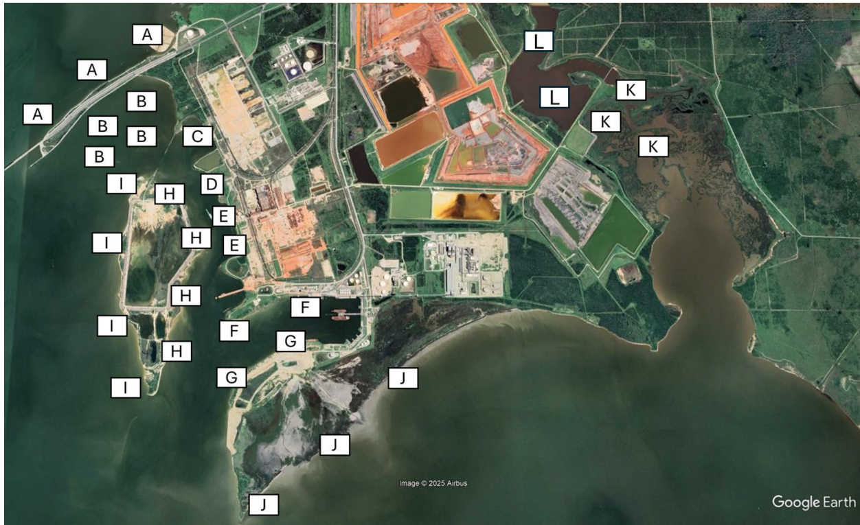
Figure 2. Sediment grab sample collection areas.

Each sample was freeze dried and powdered, and subsampled for the following analyses: Hg concentration, concentration of other trace elements (same list as objective 1), moisture content, grain size (coarse vs fine; i.e., sand vs silt/clay), and organic matter content. Progress to date is shown in Table 1.