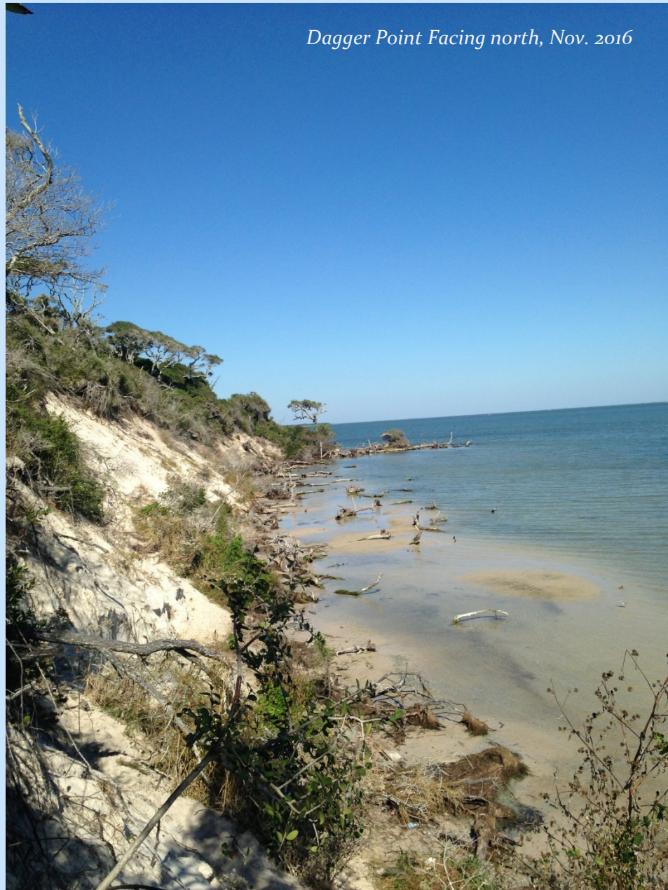
Dagger Point Facing north, Nov. 2016