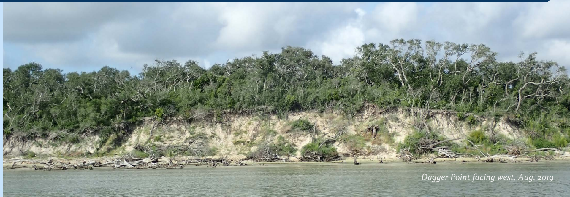
Dagger Point facing west, Aug. 2019