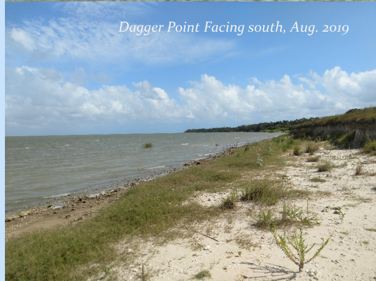
Dagger Point Facing south, Aug. 2019