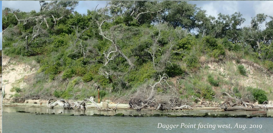
Dagger Point facing west, Aug. 2019